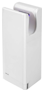
Reference: 11.107 white