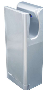
Reference: 11.108 silver grey