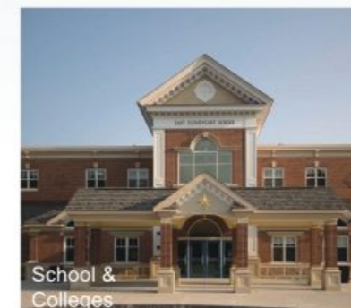
School & Colleges