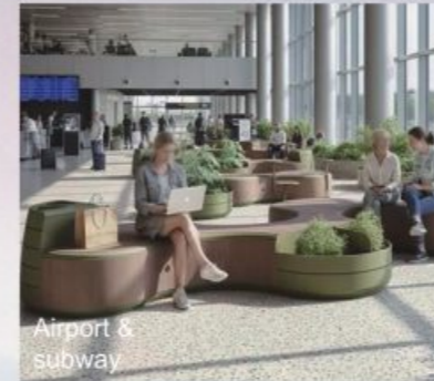
Airport & subway

We offer versatile washroom solutions suitable for a full range of public and commercial scenarios.