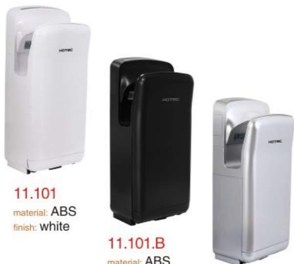
11.101 material: ABS finish: white