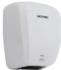
11.232.W finish: cast iron White