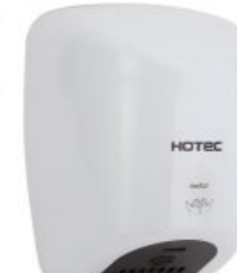
11.242.W finish: cast iron White