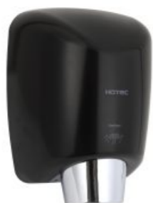
11.252.B finish: cast iron Black