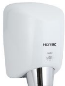
11.252.W finish: cast iron White