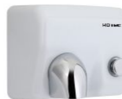
11.224.W material: cast iron finish: white enamelled coating