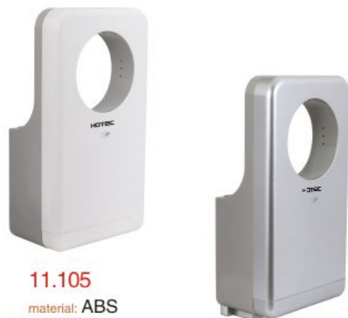
11.105 material: ABS finish: white