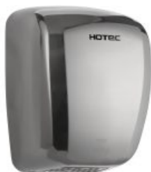
11.233.PB finish: PVD gun metal