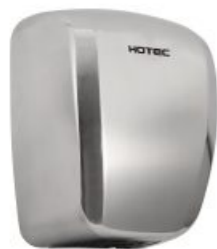
11.233.B finish: 304 stainless steel bright