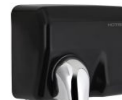
11.221.B material: cast iron finish: black enamelled coating