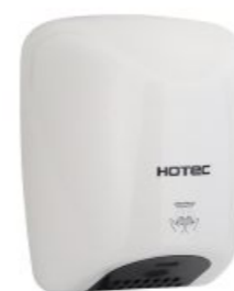
11.241 finish: ABS White