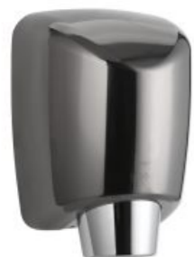
11.253.PB finish: PVD gun metal