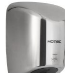
11.243.B finish: 304 stainless steel bright