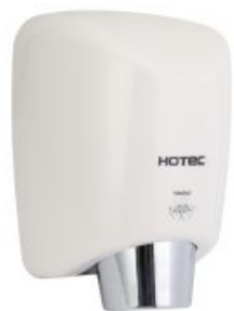
11.251 finish: ABS White