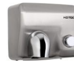
11.226 material: 304 stainless steel finish: satin