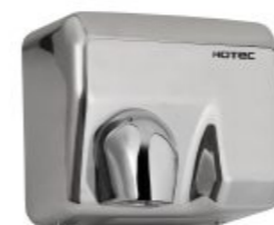
11.222 material: 304 stainless steel finish: bright