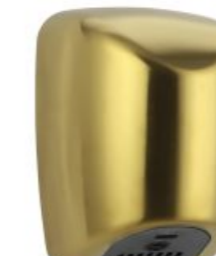
11.243.PG finish: PVD golden