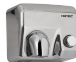
11.225 material: 304 stainless steel finish: bright