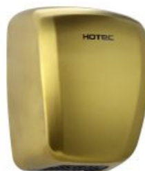
11.233.PG finish: PVD golden