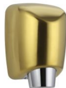
11.253.PG finish: PVD golden