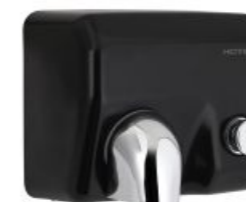
11.224.B material: cast iron finish: black enamelled coating