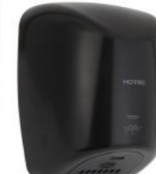
11.242.B finish: cast iron Black