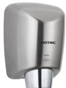
11.253.B finish: 304 stainless steel bright