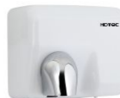
11.221.W material: cast iron finish: white enamelled coating