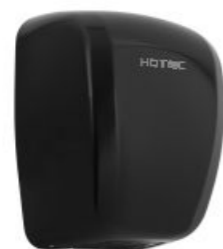
11.232.B finish: cast iron Black