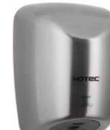
11.243.S finish: 304 stainless steel satin