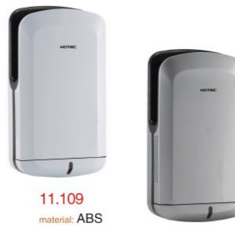
11.109 material: ABS finish: white