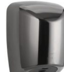
11.243.PB finish: PVD gun metal