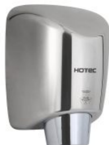
11.253.S finish: 304 stainless steel satin