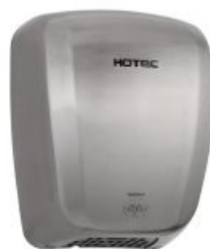
11.233.S finish: 304 stainless steel satin