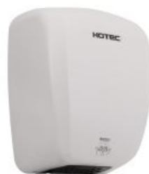
11.231 finish: ABS White