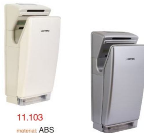
11.103 material: ABS finish: white