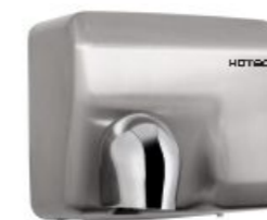
11.223 material: 304 stainless steel finish: satin