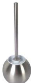
16.607 material: stainless steel dimension: Φ 140xH375mm