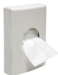
16.653 Sanitary bag dispenser material: ABS capacity: 25pcs colour: white