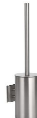
16.6011 material: 304 stainless steel dimension: 89x123xH(150-400)mm