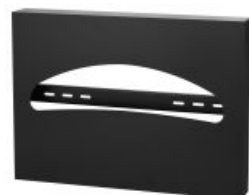
14.122 material: 304 stainless steel dimension: 420x300x50mm