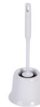
16.615 material: polypropylene dimension: (105-145) xH390 mm