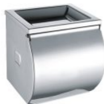
16.624a material: stainless steel dimension: 125x125x120mm