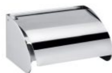
16.621a material: 304 stainless steel dimension: 132x85x65mm