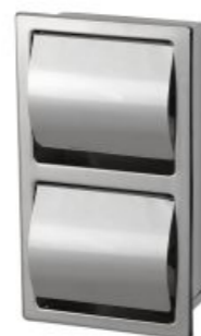
16.627b material: 304 stainless steel dimension: 158x298x68mm