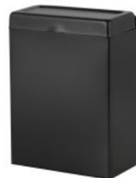
17.501 Sanitary bin capacity: 4L material: 304 stainless steel dimension: 260x190x90mm