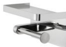
16.643 material: 304 stainless steel dimension: 183x92x100mm