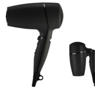
12.301 material: ABS finish: black/white