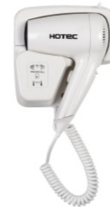
12.205 material: ABS finish: white