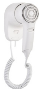
12.203 material: ABS finish: white