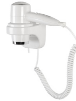
12.204 material: ABS finish: white