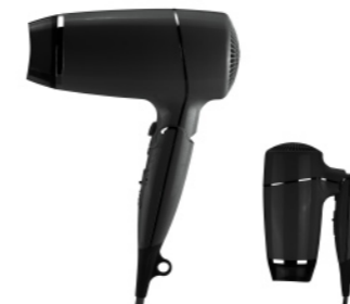
12.302 material: ABS finish: black/white