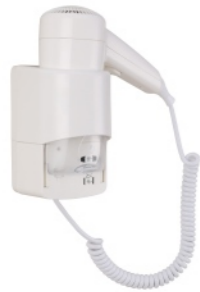
12.201 material: ABS finish: white