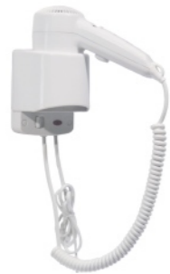
12.202 material: ABS finish: white