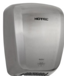
11.233.S finish: 304 stainless steel satin