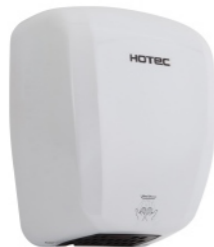
11.232.W finish: cast iron White