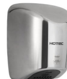
11.243.B finish: 304 stainless steel bright