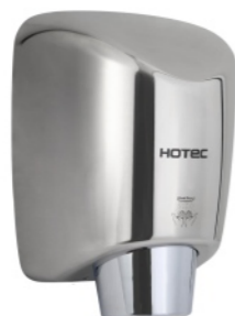
11.253.S finish: 304 stainless steel satin