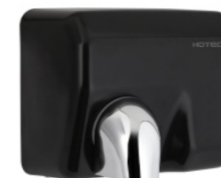
11.221.B material: cast iron finish: black enamelled coating