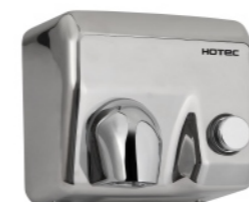
11.225 material: 304 stainless steel finish: bright