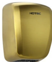
11.233.PG finish: PVD golden