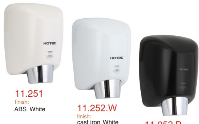
11.251 finish: ABS White