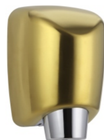
11.253.PG finish: PVD golden