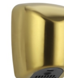
11.243.PG finish: PVD golden