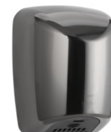
11.243.PB finish: PVD gun metal