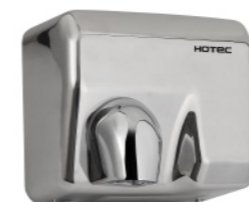
11.222 material: 304 stainless steel finish: bright