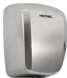
11.233.B finish: 304 stainless steel bright