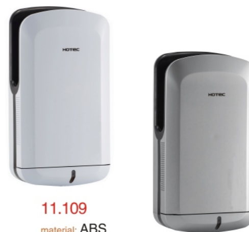
11.109 material: ABS finish: white