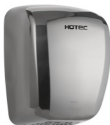
11.233.PB finish: PVD gun metal