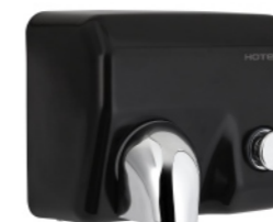
11.224.B material: cast iron finish: black enamelled coating