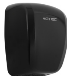
11.232.B finish: cast iron Black