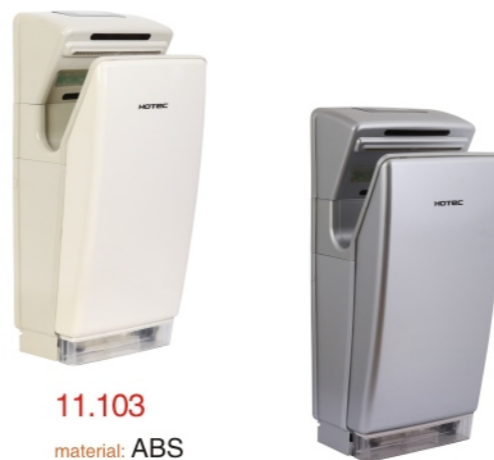
11.103 material: ABS finish: white