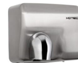
11.223 material: 304 stainless steel finish: satin