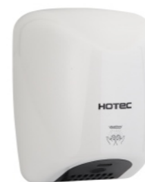
11.241 finish: ABS White