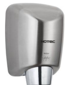
11.253.B finish: 304 stainless steel bright