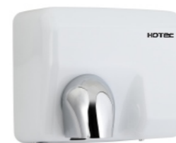
11.221.W material: cast iron finish: white enamelled coating