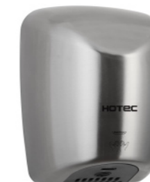
11.243.S finish: 304 stainless steel satin