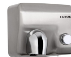
11.226 material: 304 stainless steel finish: satin