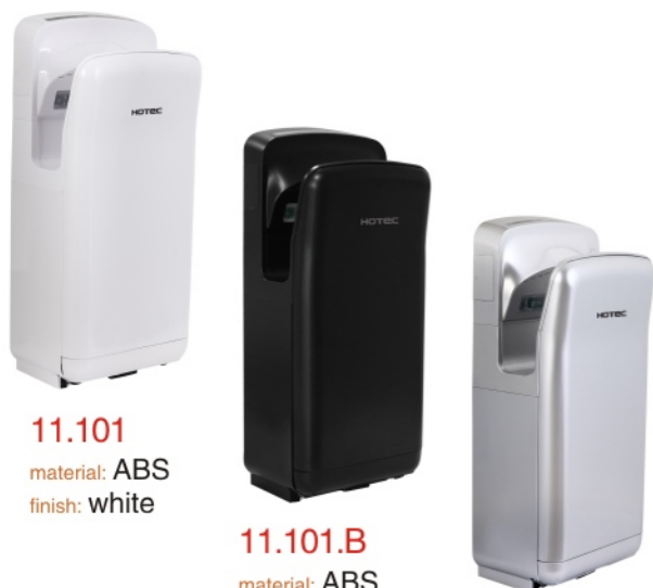
11.101 material: ABS finish: white