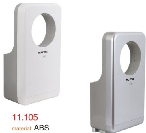
11.105 material: ABS finish: white