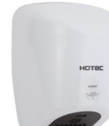
11.242.W finish: cast iron White