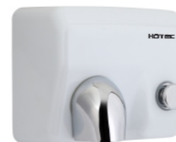
11.224.W material: cast iron finish: white enamelled coating