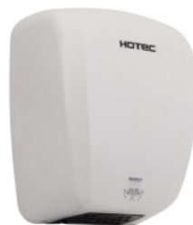
11.231 finish: ABS White