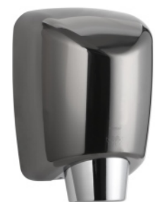
11.253.PB finish: PVD gun metal