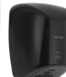
11.242.B finish: cast iron Black