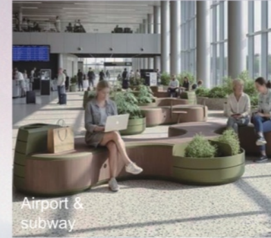
Airport & subway

We offer versatile washroom solutions suitable for a full range of public and commercial scenarios.