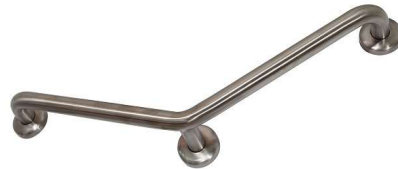
15.211.ST stain finish