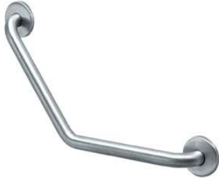
15.211.S, 15.212.S, 15.213.S stain finish