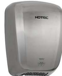
Reference: 11.233.S 304 stainless steel satin