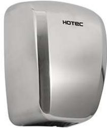
Reference: 11.233.B 304 stainless steel bright