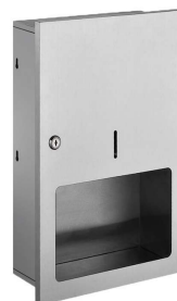
Reference: 14.402 304 stainless steel satin