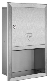
Reference: 14.401 304 stainless steel satin