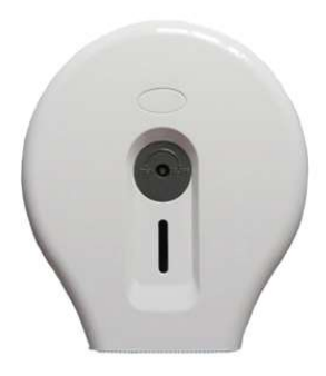
Reference: 14.201 ABS white