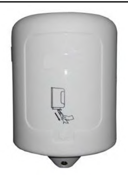
Reference: 14.215 ABS white