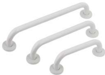
15.101.W, 15.104.W, 15.106.W