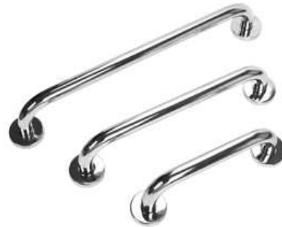
15.101.C, 15.104.C, 15.106.C