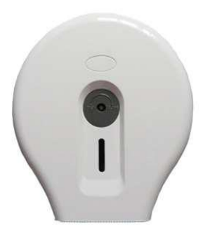
Reference: 14.201 ABS white