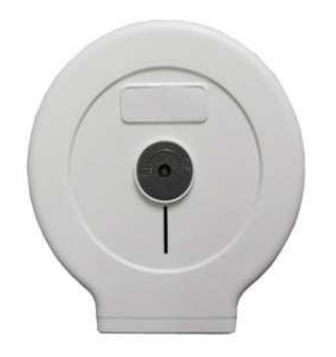
Reference: 14.211 ABS white