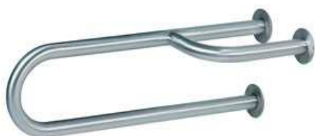
15.251.S, 15.252.S stain finish